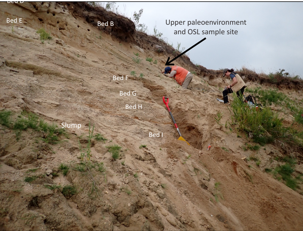
Circus section, viewed from the left side, adjacent to the gully.